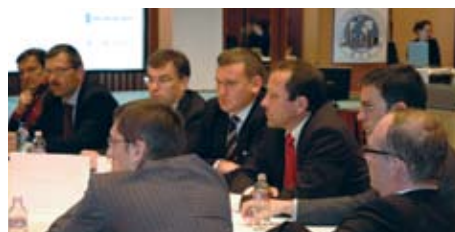
TABLE ONE: OLEFINS

Interactive open discussions providing the opportunity to exchange ideas and information with our senior petrochemical experts on key issues affecting the industry.